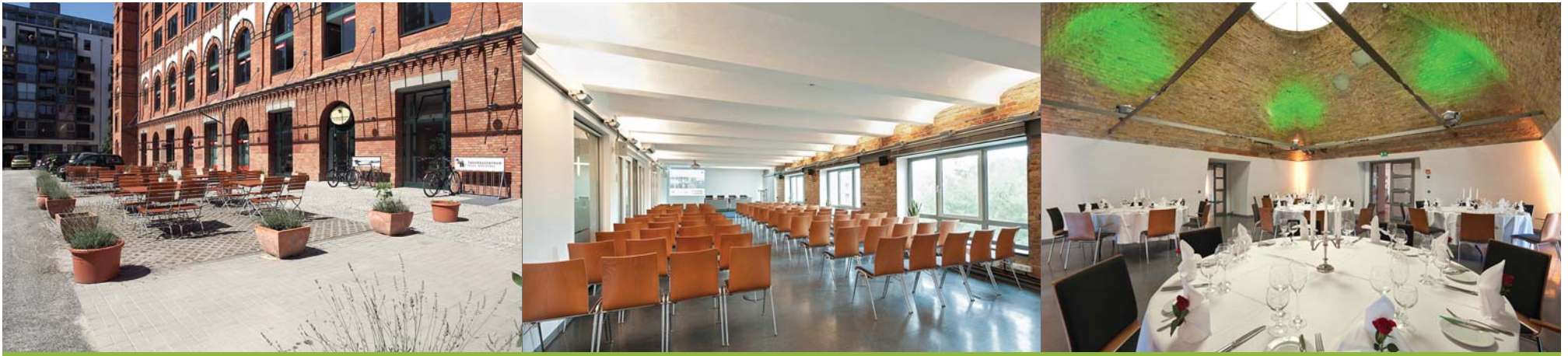
5 th Floor